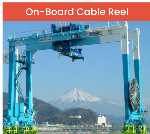
On-Board Cable Reel

PACECO-Mitsui has solutions to make your terminal operations sustainable now and into the future.