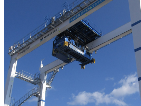
Your yard as usual