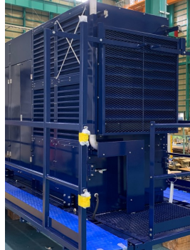
Fuel Cell Power Pack (FCPP) Safe & proven FC technology provides ample power to batteries to deliver the performance you expect