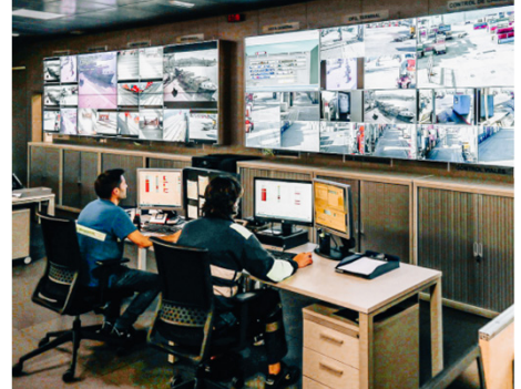
Future upgrades Automation upgrade options available: