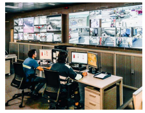
Future upgrades Automation upgrade options available: -Remote operation