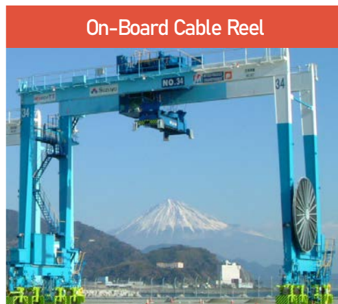
On-Board Cable Reel

PACECO-Mitsui has solutions to make your terminal operations sustainable now and into the future.