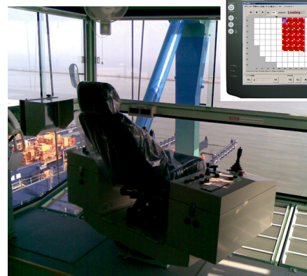
Mobile Data Terminal

In case of adopting the Vessel Plan computer system, work instruction is displayed on the Mobile Data Terminal in Operator's cab. (option)